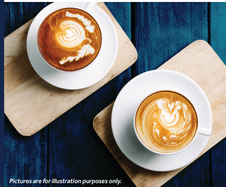
Pictures are for illustration purposes only.