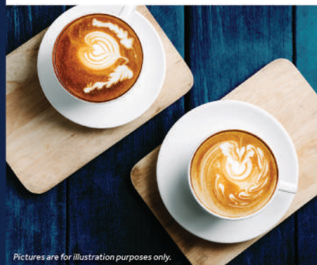
Pictures are for illustration purposes only.